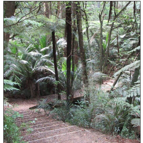
Birkenhead War Memorial Park

Just nine walkers braved the summer heat for the first outing of 2024. Assembling at Birkenhead Leisure Centre, we walked first through Birkenhead War Memorial Park, emerging via eighty-six steps onto Parkhill Road and heading downhill. One helpful member observed that going down inevitably leads to climbing back up. That was proved true when, after a short bush walk through Ridgewood Reserve and another downhill stretch on Eskdale Road, we faced a long uphill slog through Eskdale Reserve. The saving grace was that most of the uphill sections were in spectacular bush, with many superb specimens of forest trees and bush affording cool shade. Next Walk: 3rd Monday Time: 10am. Venue: TBA. VACANCY