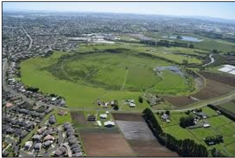
Pukaki Crater, Manukau

We were out in the field for our February meeting viewing some of the South Auckland volcanoes - Puhinui, Cemetery, Kohoura, Crater Hill and Pukaki Lagoon. These were all wet explosion craters with no scoria cone. Puhinui was only recognized as a volcano in 2011. Cemetery Crater is hard to spot because the SW motorway cuts it off from the nearby cemetery after which it is named. Kohoura Park, Papatoetoe, is well worth a visit. Three of the craters are a wetland area with a board walk. Crater Hill was not to be seen because the view point is blocked by new housing.