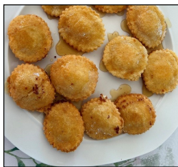
Seadas - dessert

In February our featured Italian region was Sardinia. We