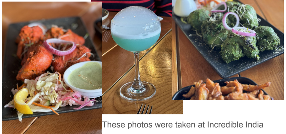
These photos were taken at Incredible India