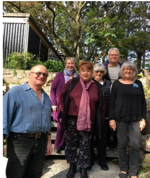
Japanese Art Inaugural meeting August 2020