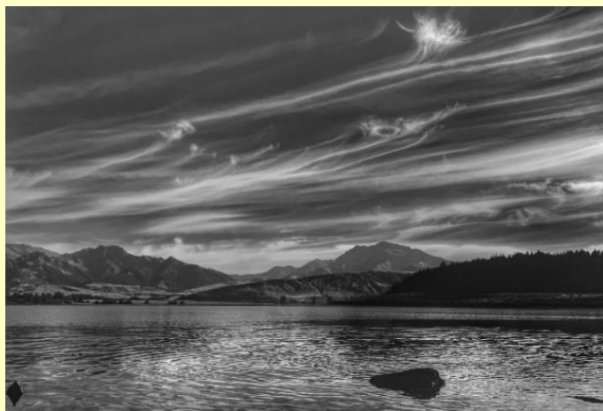
"Sweeping Along", 2021, Liz Holland

Thank you to those members who have forwarded "cloud effect" photos: we love them and are happy to continue to receive more! Here is a selection: