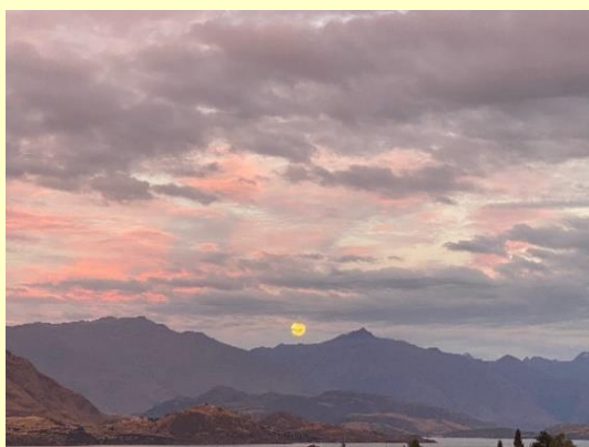
Moon setting over Black Peak, Ruth Highet