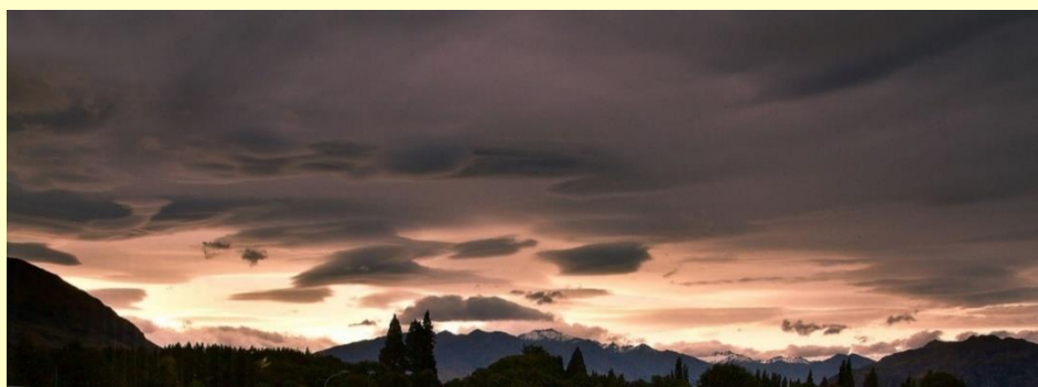
A glider pilot's dream - altocumulus lenticularis and fracto cumulus, Allen Hogan