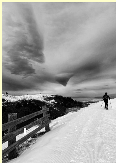
'Coming to get you', Snow Farm 2020, Liz Holland